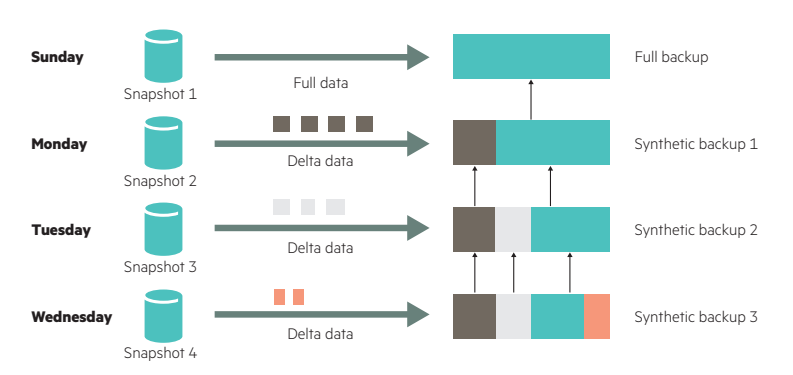
Figure 2. Incremental and synthetic full backups

RMC backup delivers up to 23X faster backups and up to 15X faster restores than traditional backup methods with 9X lower CPU consumption.<sup>1</sup>